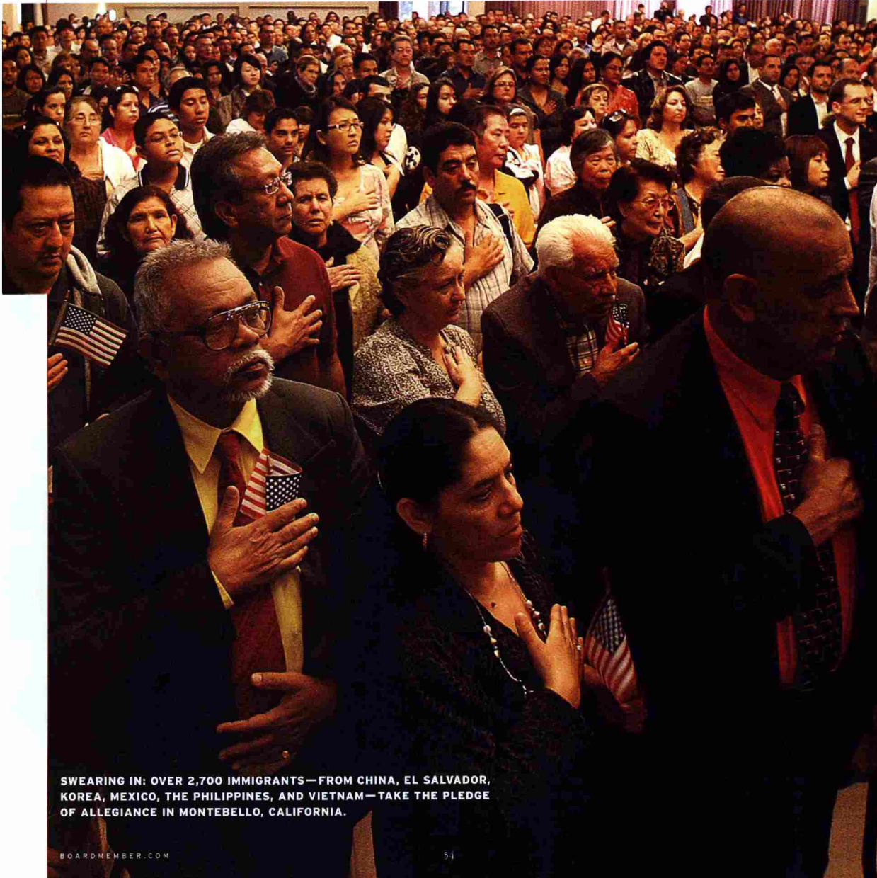
SWEARING IN: OVER 2,700 IMMIGRANTS—FROM CHINA, EL SALVADOR, KOREA, MEXICO, THE PHILIPPINES, AND VIETNAM—TAKE THE PLEDGE OF ALLEGIANCE IN MONTEBELLO, CALIFORNIA.