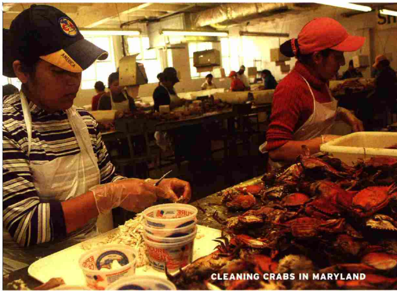
CLEANING CRABS IN MARYLAND

Even where immigrants and natives have similar education levels—in that broad bulge of the labor market that graduated from high school but not college—they gravitate toward different jobs, Peri found. Immigrants are concentrated in “manual-intensive” positions such as driver or maintenance man. Natives use their superior knowledge of the language to find “communication-intensive” jobs: dispatcher, salesperson, customer-service rep. An abundance of manual workers seems to make it easier to start businesses that communication-oriented workers manage and promote. A prominent example is New York City’s vital restaurant industry, where 72% of the cooks are immigrants, roughly half of them illegal, according to the Fiscal Policy Institute in Manhattan. Similar, though on a smaller scale, are the clutch of crab-processing plants on the Eastern Shore of the Chesapeake Bay, where fresh crabs are a great summer tourist attraction. Each foreign-born laborer doing the dirty work of extracting meat from shell sustains 2.5 jobs for the locals