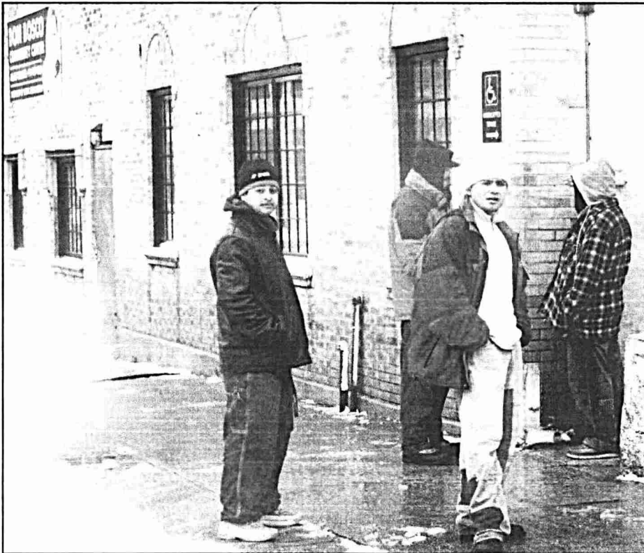
A group of laborers waits for work in the freezing rain outside the Don Bosco Hiring Site on Wednesday.

Printing imperfections present during scanning